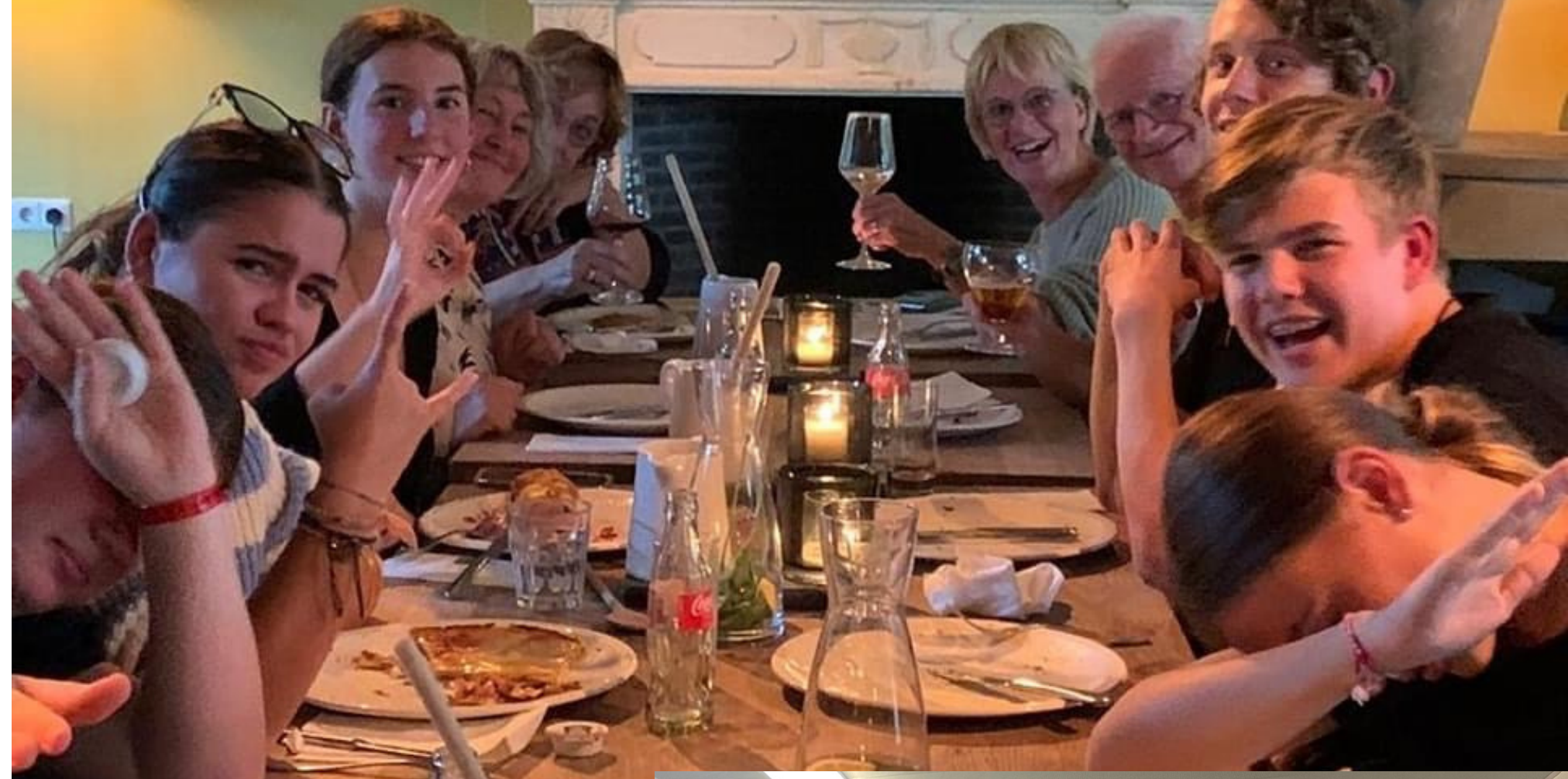
All of the people we had a chance to met