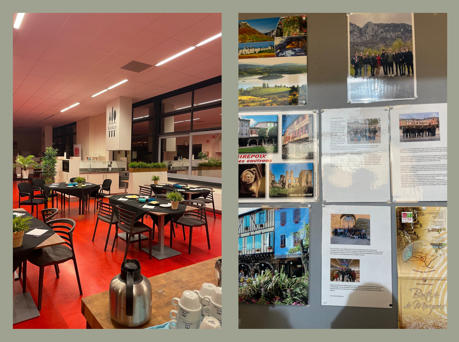
beautiful place where we can wait class